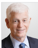
MARIO J. GABELLI, CFA Chief Executive Officer GAMCO Investors, Inc.